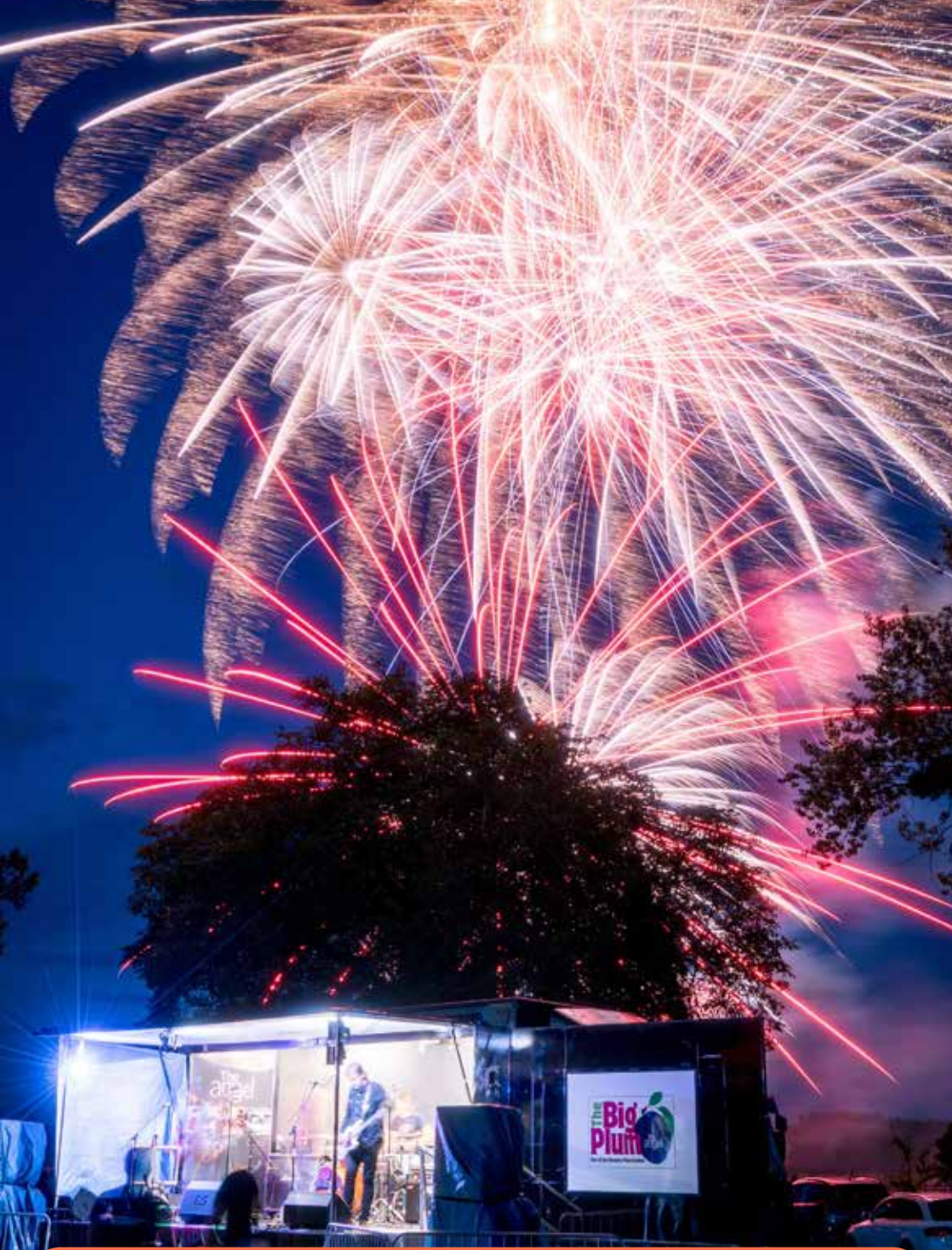
Pershore's biggest beer, live music and fireworks festival